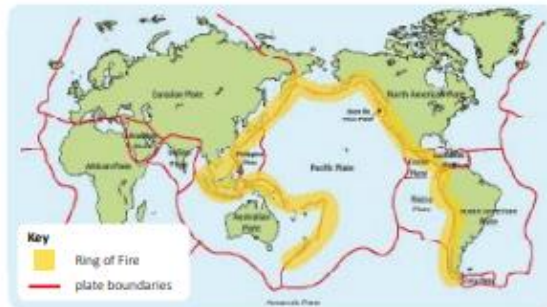
Earth's tectonic plates

The tectonic plates that make up the Earth's crust float on top of the mantle and are constantly moving. The places where tectonic plates meet are called plate boundaries. Tectonic plates can push together, pull apart or slide against each other. This movement at the plate boundaries can cause volcanic eruptions, earthquakes and tsunamis.