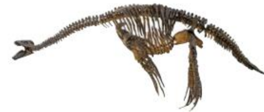
fossilised Plesiosaur skeleton

Mary Anning (1799–1847) was an English fossil collector. She lived in Lyme Regis in Dorset, in an area now known as the Jurassic Coast. Mary had little formal education but was taught fossil hunting by her father. She made many important fossil discoveries during her lifetime, including an Ichthyosaurus fossil in 1811 and a fossilised Plesiosaur in 1823.