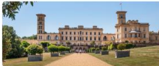
Osborne House is on the Isle of Wight, England. This was Queen Victoria's favourite holiday home.