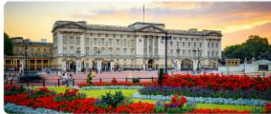
Buckingham Palace is in London, England. It is the Queen's main residence.

Royal residences include palaces, castles and stately homes. Some of them are used for official royal business and some are used as holiday or private homes.