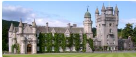
Balmoral Castle is in Aberdeenshire, Scotland. It is used mainly as a holiday home for the Royal Family.