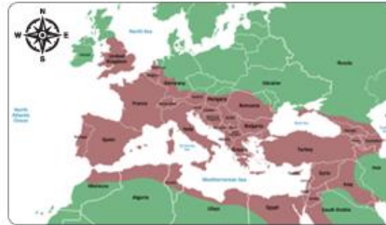
Roman Empire, AD 117–200

The Roman army conquered countries all around the Mediterranean Sea and so the Roman Empire grew to include many neighbouring lands. It was at its largest between AD 117 and AD 200.