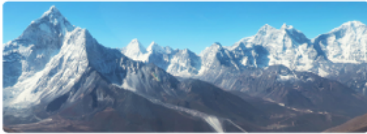
Himalayas mountain range

A mountain is a large, raised part of the Earth's surface. A mountain's highest point is called its peak or summit. Mountains are at least 610m in height. A mountain range is a chain of mountains that are close together. They are usually arranged in a line connected by ridges.